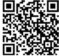
Scan for Online Information

Online Product Support: www.lacrossetechnology.com/404-1225